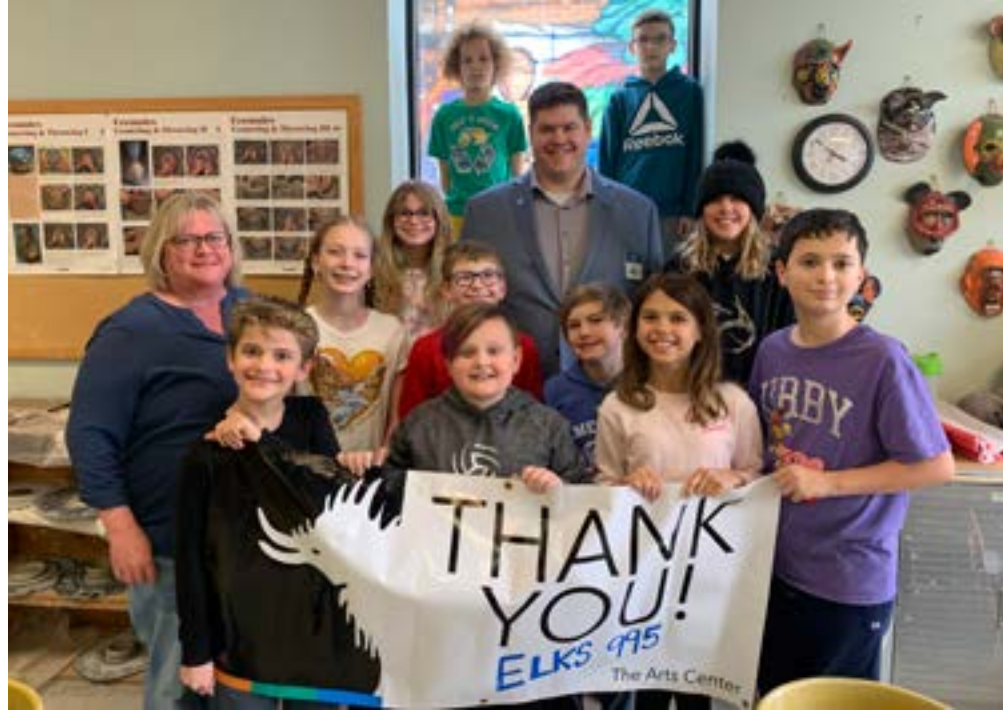
"Thank you to Elks #995 for their donation of Arts After School supplies."